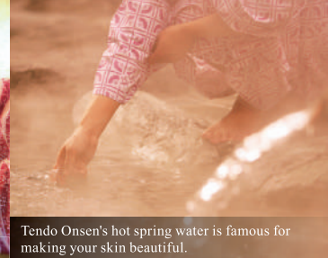
Tendo Onsen's hot spring water is famous for making your skin beautiful.