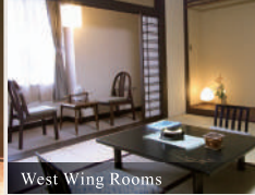
West Wing Rooms