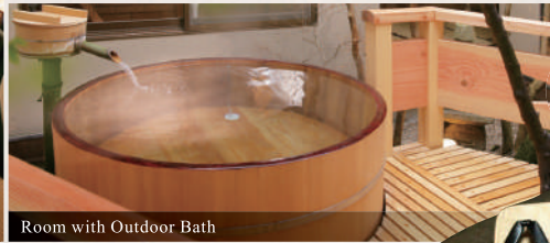
Room with Outdoor Bath