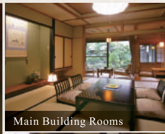
Main Building Rooms