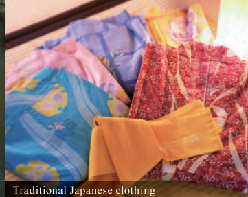
Traditional Japanese clothing