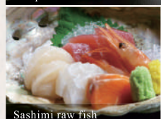
Sashimi raw fish