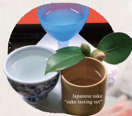
Japanese sake "sake tasting set"