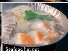
Seafood hot pot