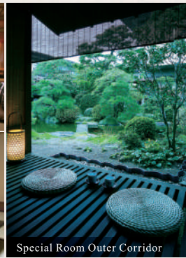
Special Room Outer Corridor